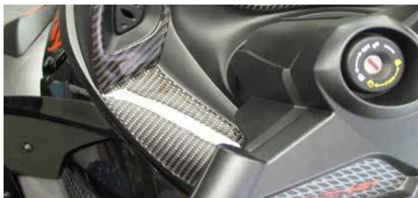
Shown in photo: Adhere Part 11 first, using the pencil line as a guide. Do not try to adhere the part all at once, rather remove the protective backing only from the bottom so you can still maintain alignment of the top without yet adhering it.