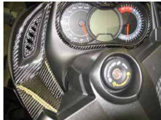
Shown in photo: Take all three parts together & perform a test fit to see exactly how the parts align.

Repeat this procedure for the equivalent right side parts (Parts 12, 14, and 20).