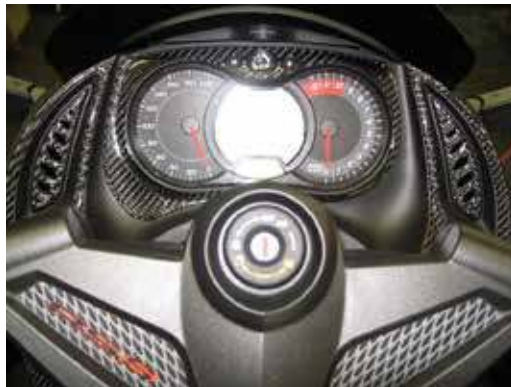
Shown in photo: Use care not to apply 3M adhesive promoter to any section of the dash that will not be covered by the part.

The remaining parts can be installed after a test alignment without difficulty.