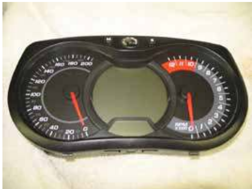
Shown in photo: Display console, removed for ease of applying 4612-05 Part-5.