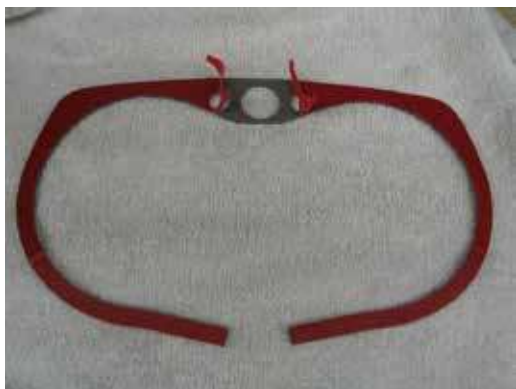
Shown in photo: Peel just enough protective backing to center part over logo & buttons.