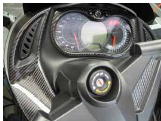
Shown in photo: Remove only the upper protective backing of Part 13 and align it with the lower end of Part 11, then gradually remove the backing while carefully aligning it to the pencil mark.