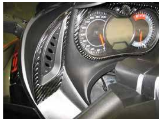
Shown in photo: Using a pencil, mark a line under the bottom of Part 11.