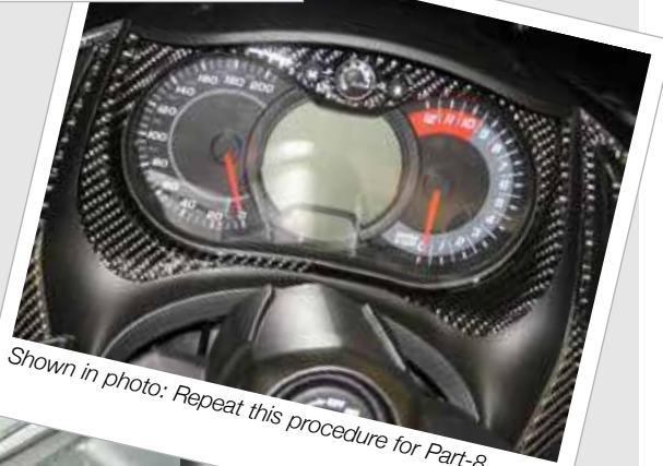
Shown in photo: Repeat this procedure for Part-8.